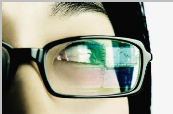
C3 Item Info 0408